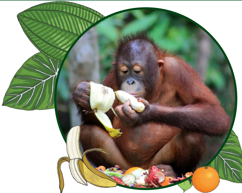
"Treasure" by Joe Hunt is licensed under CC BY 2.0

plantation – An area in which trees or crops have been planted.