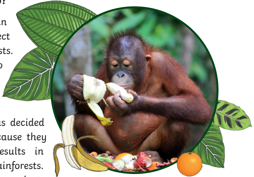
"Treasure" by Joe Hunt is licensed under CC BY 2.0

Firstly, we can choose to buy products that do not contain any palm oil at all. Iceland, a supermarket in the UK, has decided to stop using palm oil because they think its manufacture results in too much harm to our rainforests. Alternatively, we could buy products which contain sustainable palm oil – that which was grown and made in a responsible way, not harming the biodiversity of the rainforests. Finally, we could contact the manufacturers of our favourite products in order to urge them to use sustainable palm oil across all of their products.